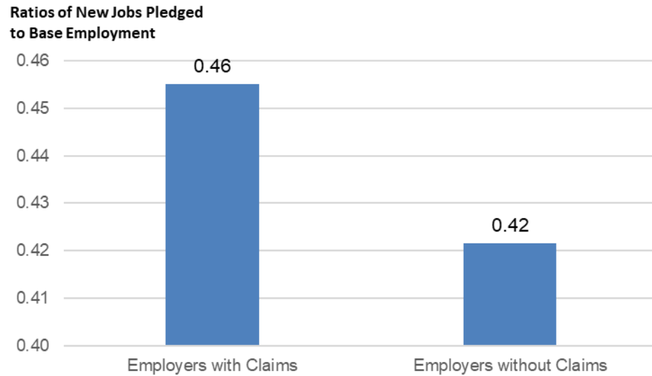
Figure 1. Ratios of New Jobs Pledged to Base Employment for Eligible Employers With and Without Claims